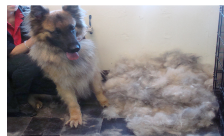
Just some of the dead-coat from a Long Haired German Shepherd

Keep them coming. Your big dogs are all very welcome!